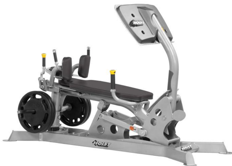
ADJUSTABLE SHOULDER PADS