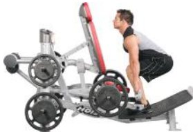
DEAD LIFT / SHRUG