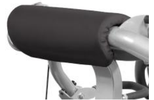
SELF ALIGNING HANDLES