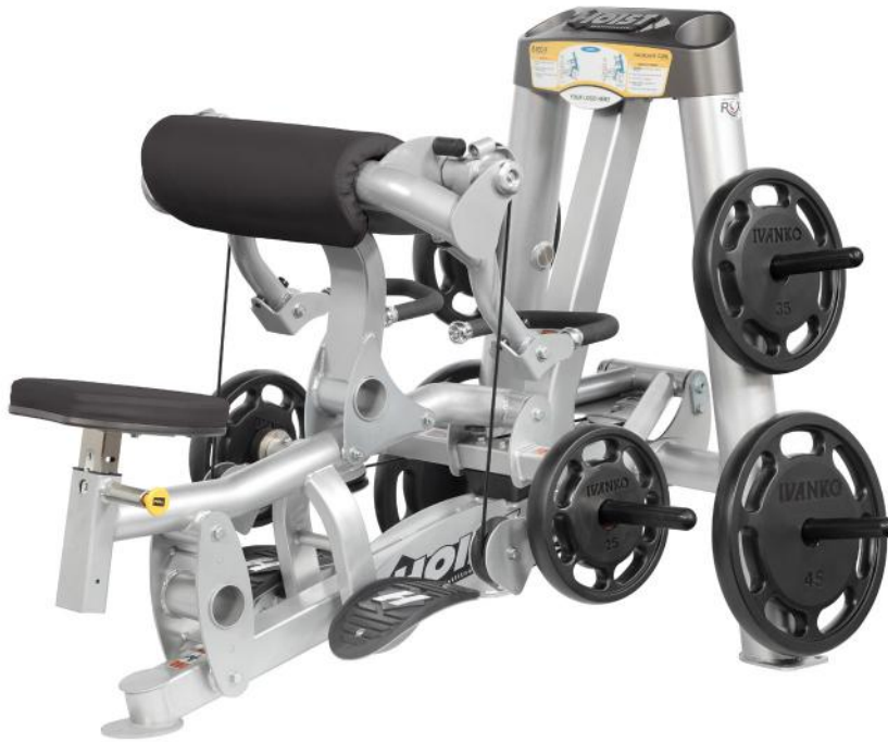
PADDED ELBOW BRACE