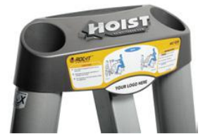
RATCHETING SEAT ADJUSTER