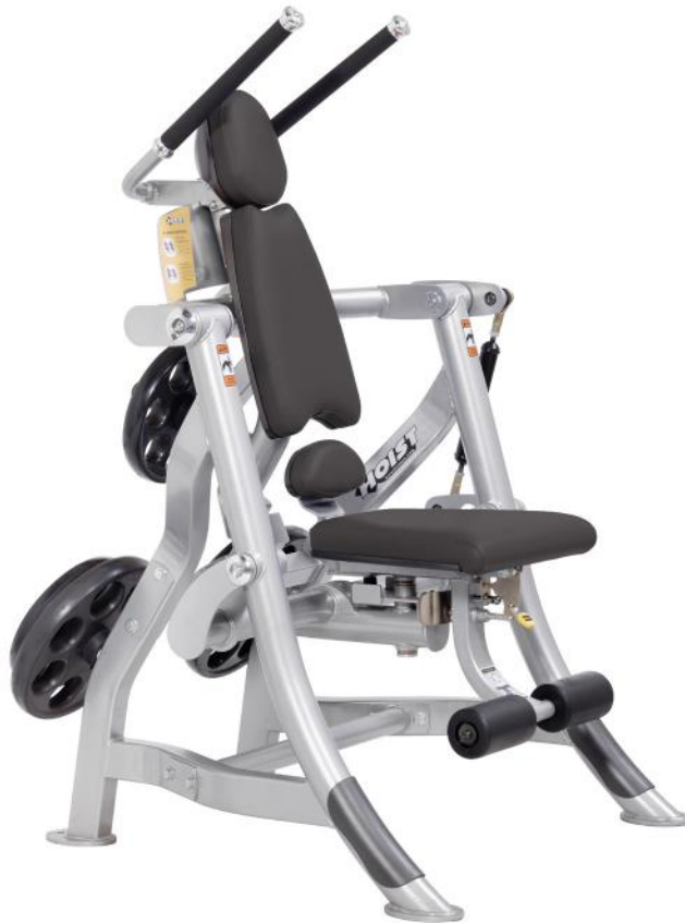
LOCKABLE PIVOTING EXERCISE SEAT