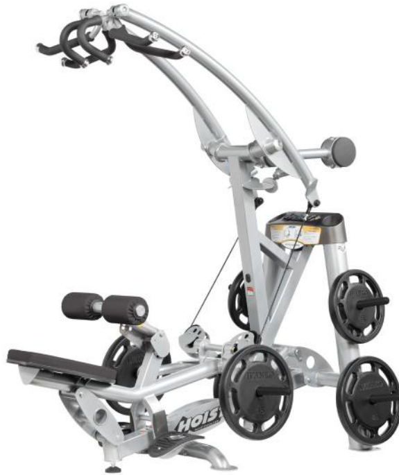
MULTIPLE GRIP HANDLES