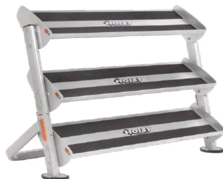
*SHOWN WITH OPTIONAL 3RD-TIER (HF-5461-OPT-48)