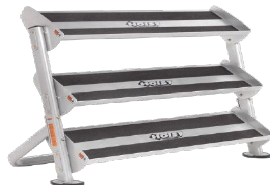
*SHOWN WITH OPTIONAL 3RD-TIER (HF-5461-OPT-60)