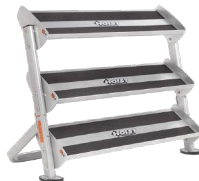
*SHOWN WITH OPTIONAL 3RD-TIER (HF-5461-OPT-36)