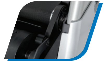
12 Groove Poly-V Belt

The CT900ENT Treadmill combines the workhorse quality and construction of the CT900 with the beauty and innovation of the entertainment display for TV, web browsing and music streaming. With a 15.6" touchscreen display, this console features intuitive function and design to make it quick and easy to get on and go. Robust construction and premium-grade components give users a smooth workout experience, while giving owners the peace-of-mind to know their equipment will live up to the rigors of consistent use.